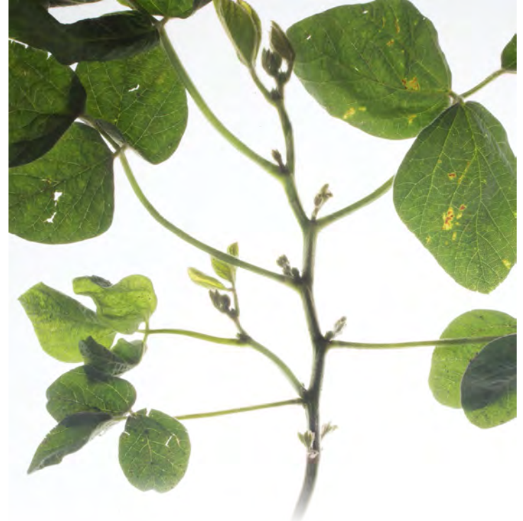
V5 Vegetative Stage Cotyledon Five open trifoliolates

Although the ideal is for leaf area and plant dry weight to continue to increase during this period without interruption, research has shown that loss in leaf area during this period typically has little or no effect on yield potential, if conditions are favorable to allow regrowth after the damage occurs. Leaf area loss due to hail or herbicide injury, or leaf area restrictions from lack of adequate water or herbicide, can all be made up if followed by a period of rapid growth.